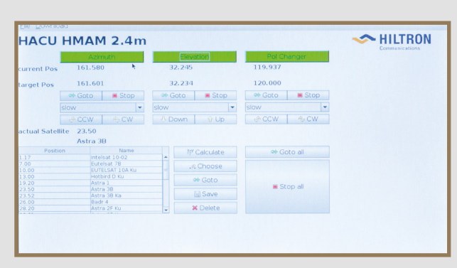
ACU Indoor Unit